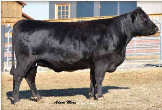
44 Blackcap Empress 533X / A daughter of this former Crazy K Ranch donor sells as Lot 57.