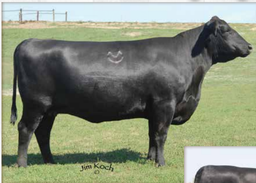
B/R Blackcap Empress 127 / The MB and $B leading donor dam of Lot 24.