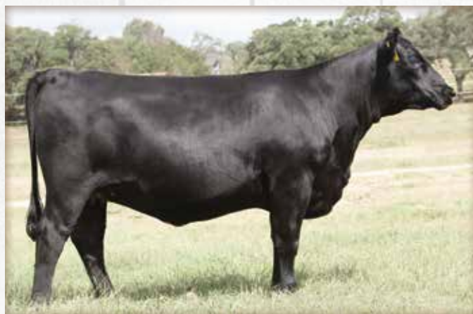
SJH Consensus of 9360 2719 / The $14,000 feature of the Spruce Mountain Ranch donor program and maternal sister to Lots 2A through 2D.