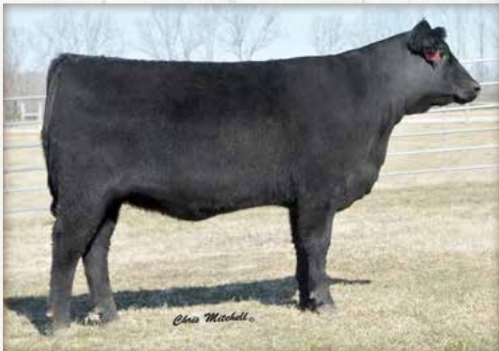
Crazy K Lucy 5018 / Lot 10A