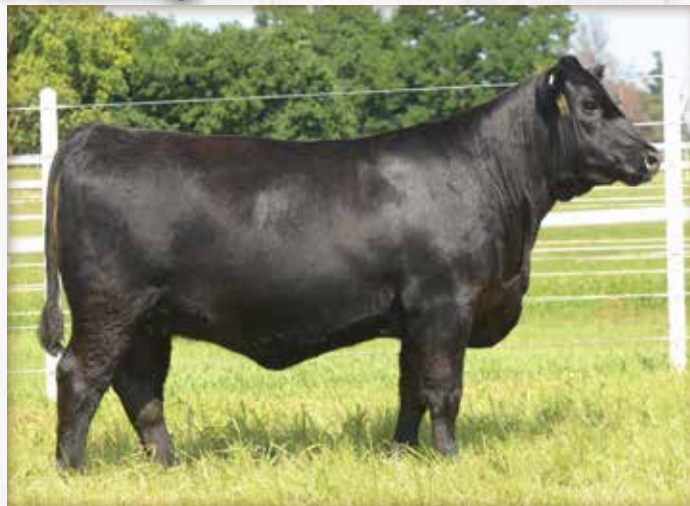
EXAR Lucy 4597 / The $240,000 valued full sister to Lot 9 selling in the 2015 Big Event to Pollard Farms.