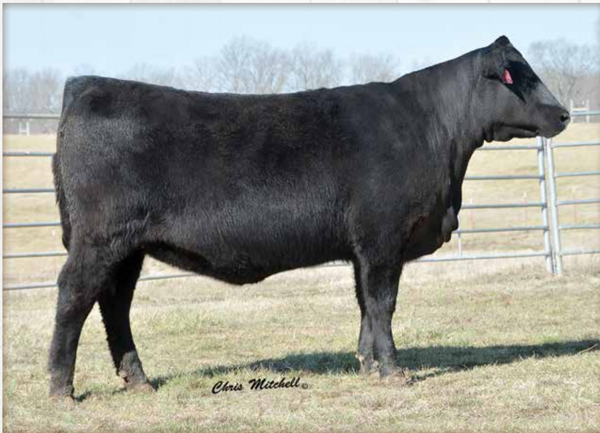
Crazy K Henrietta 5022 / Lot 13B