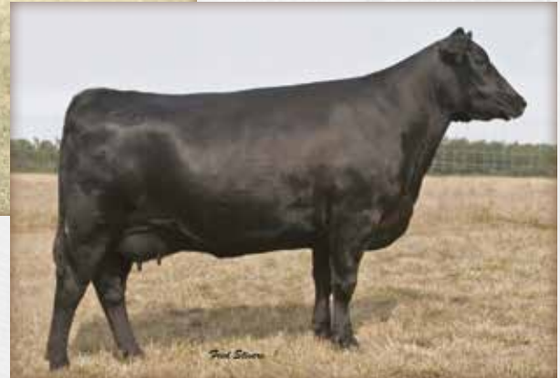
Baldridge Rita R138 / A granddaughter of this foundation Hudson Pines Farm donor sells as Lot 30.