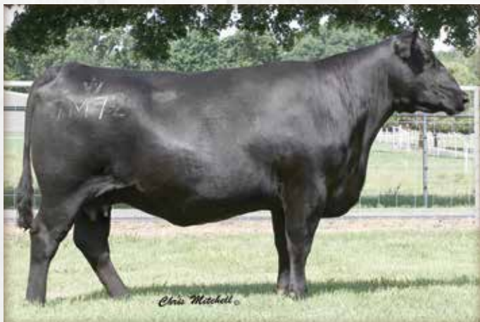
Rita 7M72 of 2536 Pred / A daughter of this cornerstone Jac's Ranch donor sells as Lot 40.