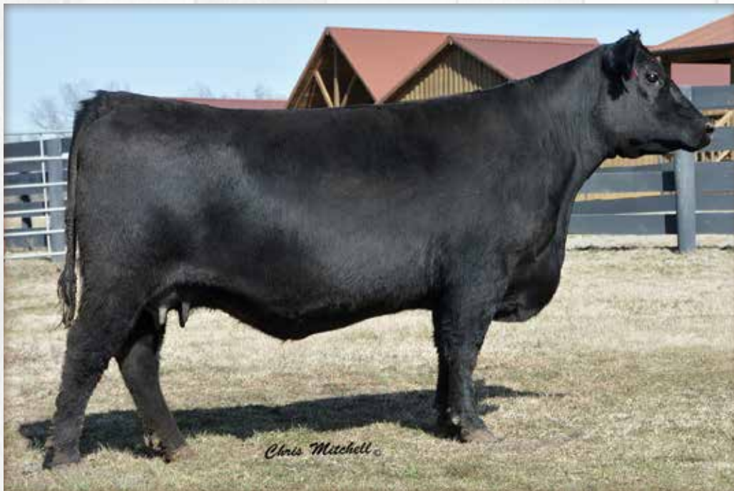
Crazy K Rita 3107 / Lot 61