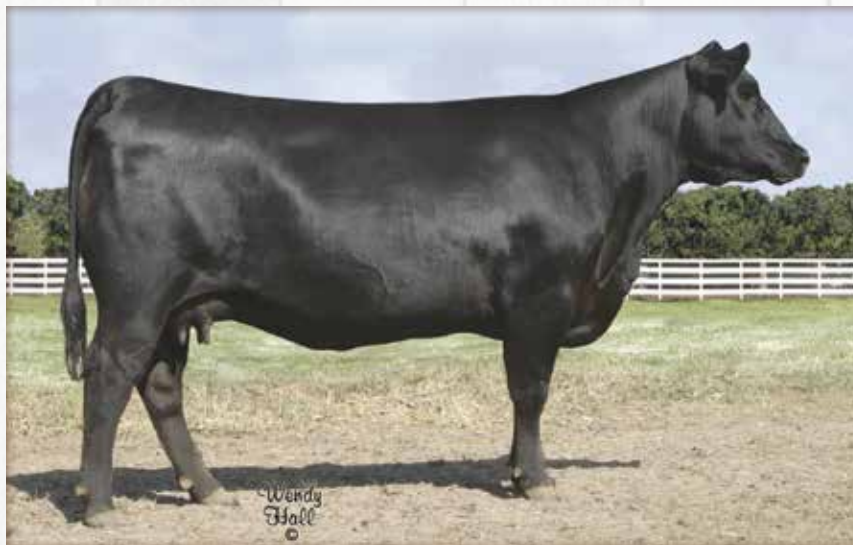
EXAR New Design 4212 / The $200,000 valued grandam of Lot 76.