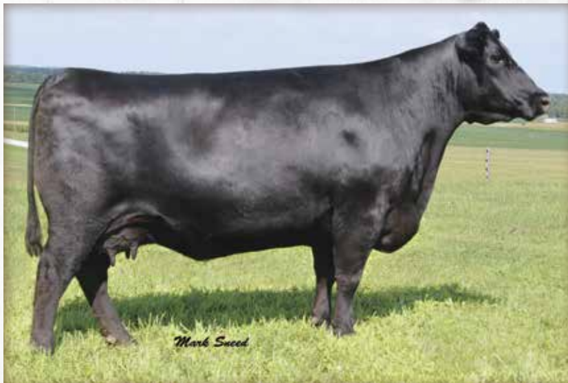
BAAR USA Lady Jaye 489 / The $89,000 prolific Crazy K Ranch donor and dam of Lots 17A through 17D.