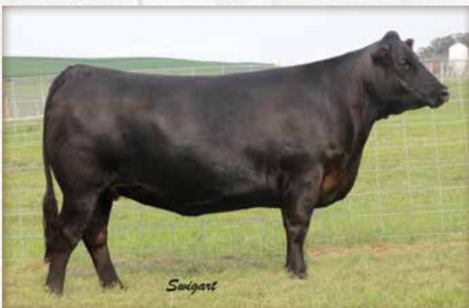
GAR 5050 New Design 0545 / A daughter of this foundation Blackstone Cattle Company and KiamichiLink Ranch donor sells as Lot 4.