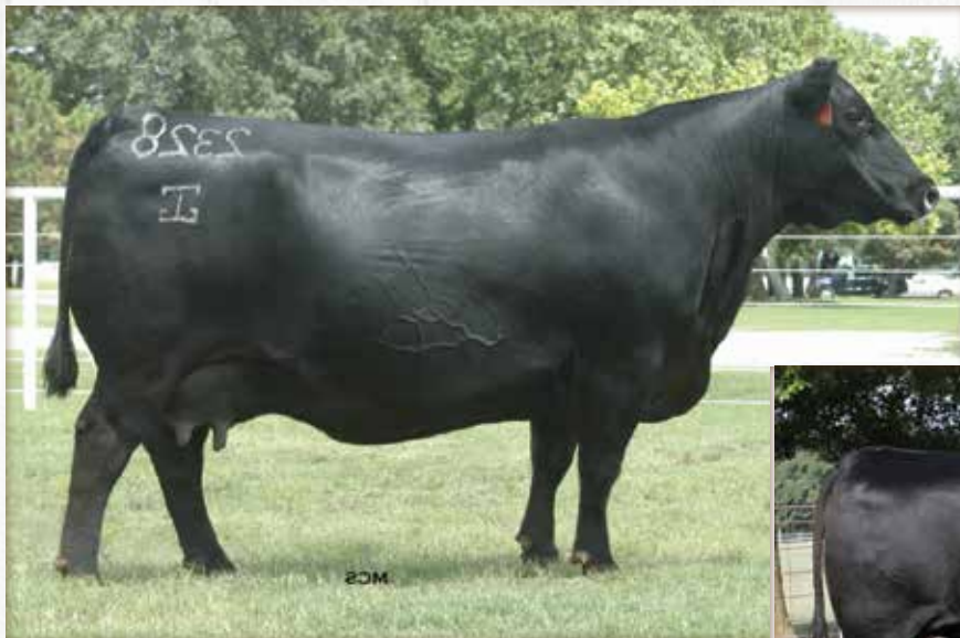
GAR 044 Traveler 2328 / The $280,000 third dam of Lot 64.