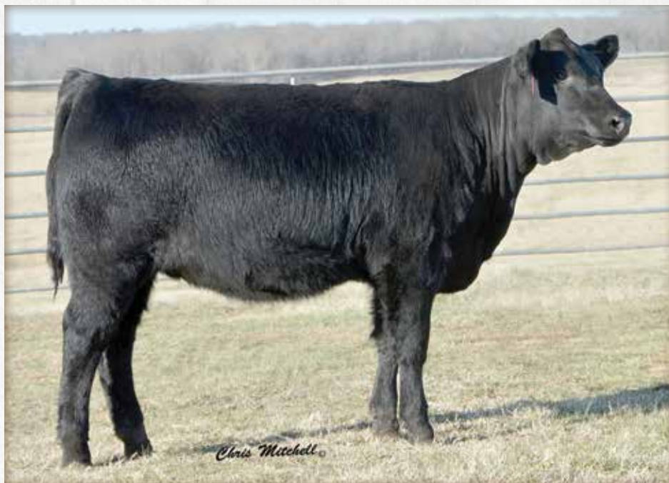
Crazy K Rita 5122 / Lot 6A