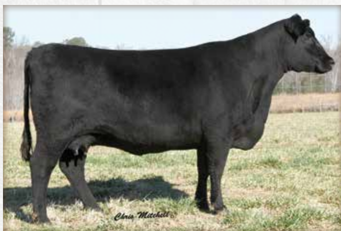
BoBo Rita 9035 / A daughter of this headliner of the upcoming first Black Gold Genetics sale sells as Lot 46.