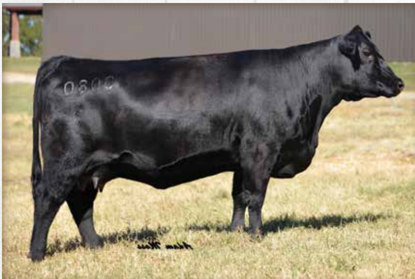
Lone Oaks Lucy 0080 / A daughter of this former Crazy K Ranch donor now featured in the Sweetgum Farms program sells as Lot 12.