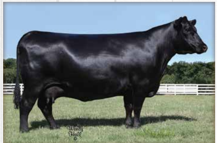
VAR Blackcap 9319 / A daughter sells as Lot 19.

Selling half interest in Blackcap 4021 the multi-trait daughter of the $100,000 valued Blackcap 9319 by the longtime Express Ranches and BoBo Angus sire, Upshot 0562B.