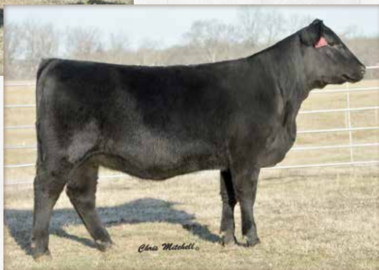
Crazy K Rita 5044 / Lot 18E