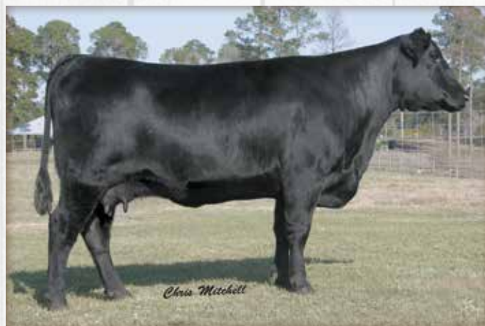
Circle A Blackcap 1029 / A granddaughter of this former Morgan Angus and Fox Run Farms donor sells as Lot 62.