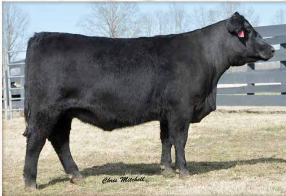
Crazy K Forever Lady 4018 / Lot 58