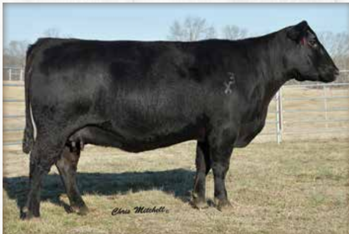
EXAR Blackcap 1748 / Daughters of this 2015 Crazy K Sale headliner sell as Lots 45A and 45B.

• Bred 12/16/15 to VAR Generation 2100. Examined safe.