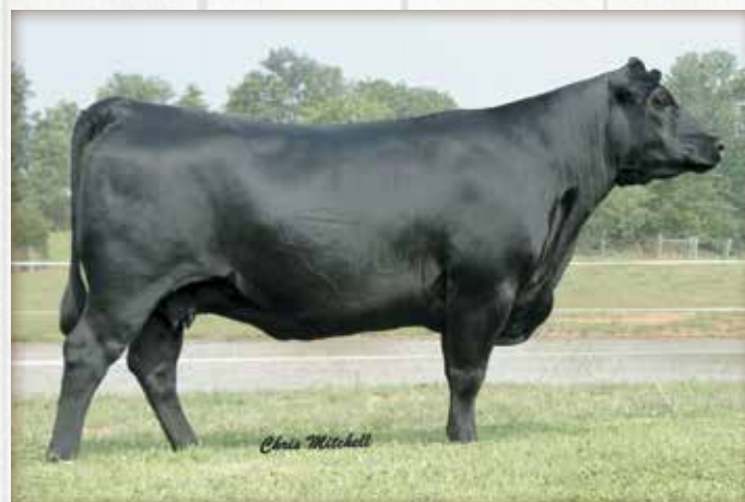
DVAR Precision 2104 981 / The foundation third dam of Lot 41 and former headliner of the Fox Run Farms donor program.