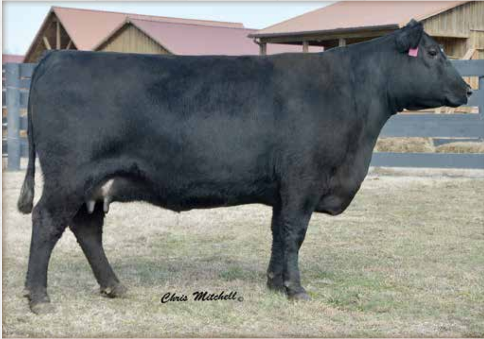
EXAR Blackbird 1757 / Lot 23