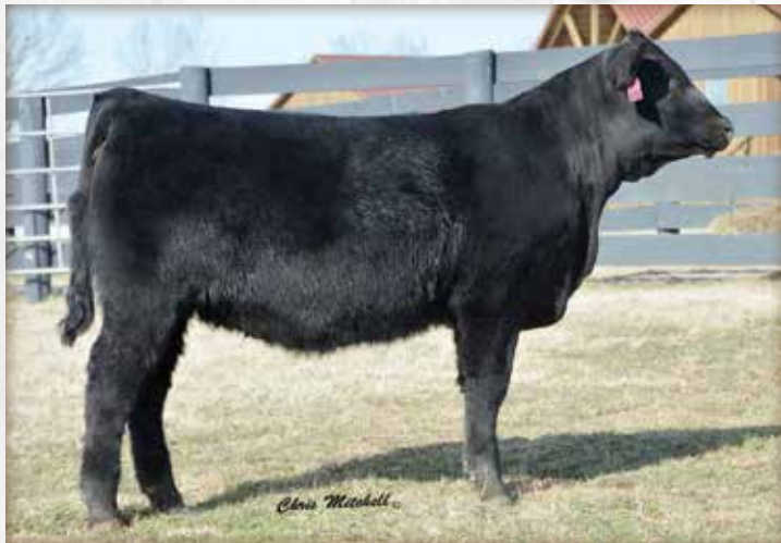
Crazy K Rita 5105 / Lot 5B