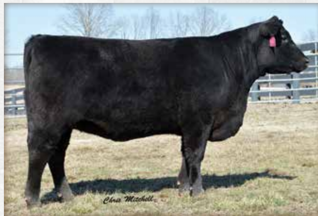
Crazy K Lady Jaye 3364 / The $10,000 selection of Jac's Ranch in the 2015 Crazy K Sale.