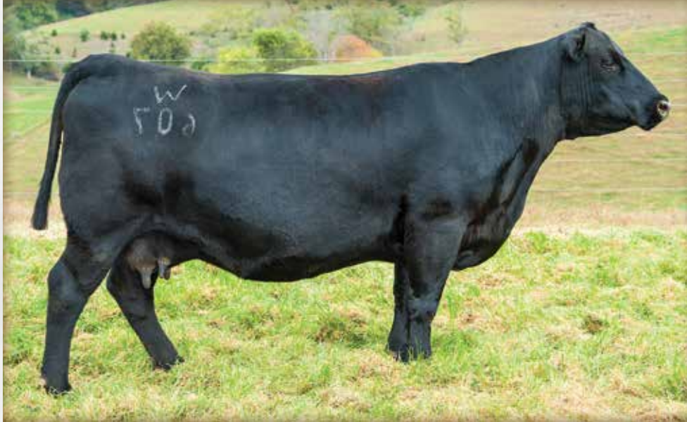
Basin Lucy S997 / A daughter of this foundation Lucy in the Lawson Angus program sells as Lot 11.