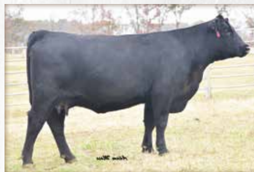
Crazy K Lucy V105 / The $80,000 donor dam of Lots 10A and 10B featured in the Black Gold and Vintage Angus Ranch joint embryo programs.