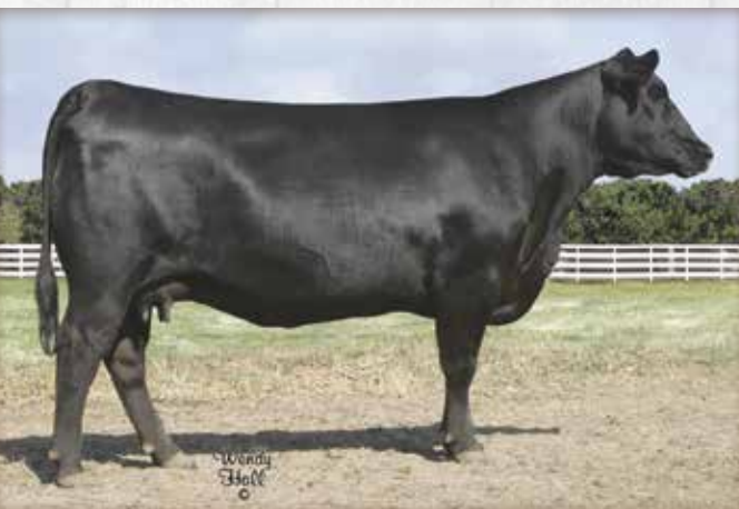
EXAR New Design 4212 / Descendants of this $200,000 valued Deer Valley Farm and Vintage Angus Ranch donor sell as Lots 19 through 22.