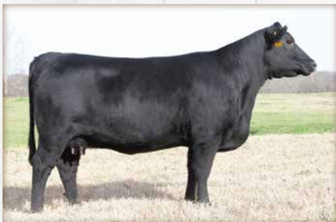
FWY Confidence of 9630 2604 / The $24,000 maternal sister to Lots 2A through 2D featured in the Spruce Mountain Ranch and Stallion Angus Ranch joint embryo programs.

• Fanny 5023 blends the multi-trait sire, Generation with the $120,000 valued new addition to the Crazy K Ranch donor program, Mile High 9360. Maternal sisters to Lots 2A through 2D include: 2701, the new addition to the Riverbend Ranch donor program; 168, the $32,250 top-selling fall pair of the 2014 HillHouse Angus Sale selected by Wilks Ranch; and 2508, the foundation female in the joint programs of Express Ranches and Fairway Farms.