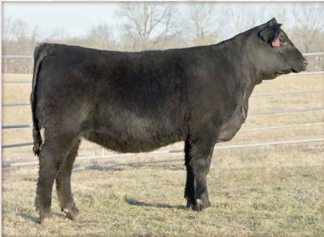
Crazy K Rita 4025 / Lot 36