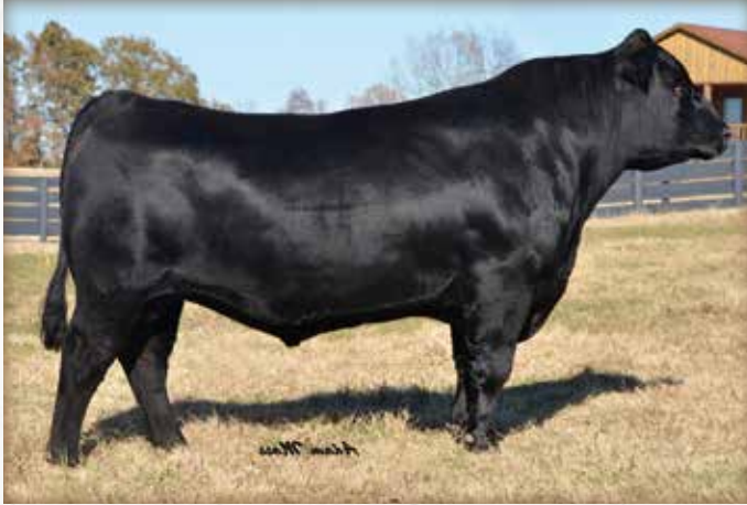
VAR Confirmed CKR 1269 / Daughters of this outstanding Crazy K Ranch and Vintage Angus Ranch herd sire sell as Lots 52 and 53.