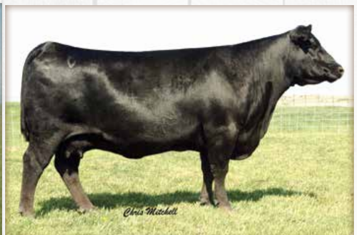
Davis YR Blackbird 558H / The $3.5 million producing grandam of Lot 23.