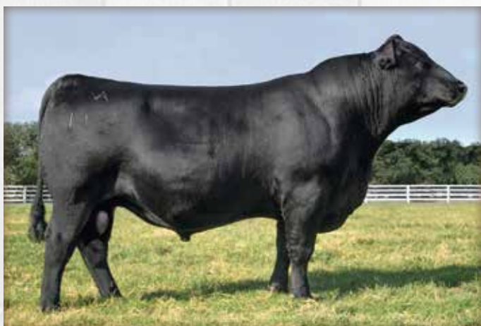
VAR Reserve 1111 / A daughter of this low-birth and carcass sire sells as Lot 56.