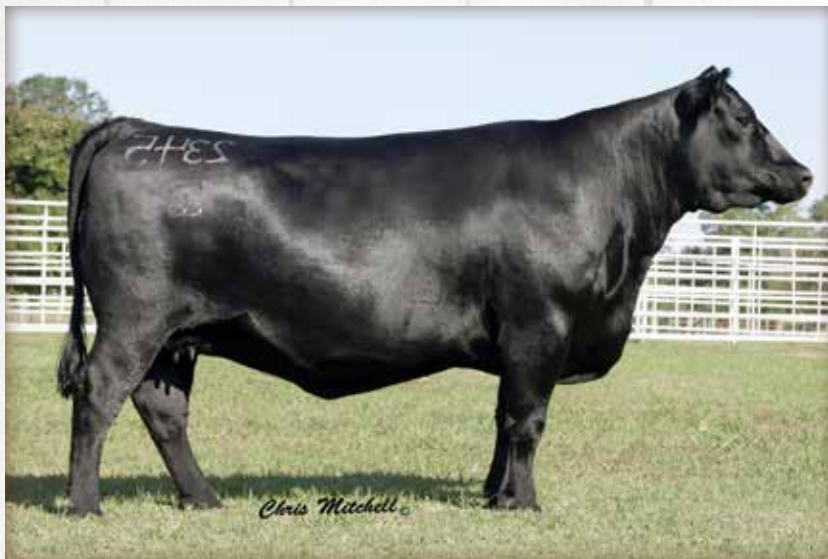
GAR Objective 2345 / The $300,000 Deer Valley matriarch, and grandam of Lot 3.