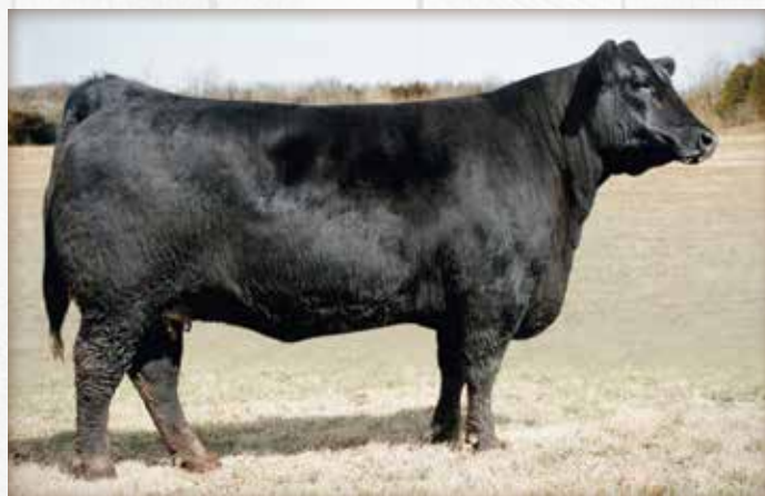
GAR Objective 1885 / The $370,000 valued donor dam of Lots 5A through 6 featured in the Crazy K Ranch and Woodside Farms programs.