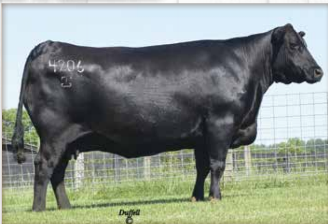
GAR EXT 4206 / The herd sire producing Pathfinder Grandam of Lot 55.