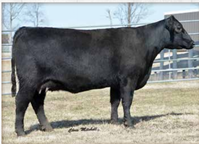
Crazy K Rachel 3142 / Lot 60