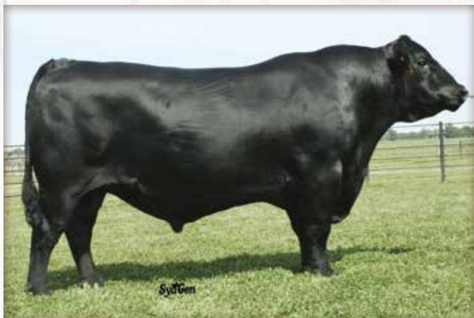
SydGen Trust 6228 / A daughter sells as Lot 73.

74 EF Everelda Entense 2453 [DDF] Birth Date: 9-4-2012 Cow 17506694 Tattoo: 2453 #GAR Predestined #B/R New Design 036 Rito 9M25 of Rita 5F56 Pred #+GAR Ext 4206 +16340278 +Rita 5F56 of 1198 FD #CA Future Direction 5321 +Rita 1198 of 2536 Rito 616 #+R/M Ironstone 4047 #CA Future Direction 5321 EF Everelda Entense 0472 B/R Ruby of Tiffany 5144 +16925815 +EF Everelda Entense 6117 #BR Midland +HF Everelda Entense 869