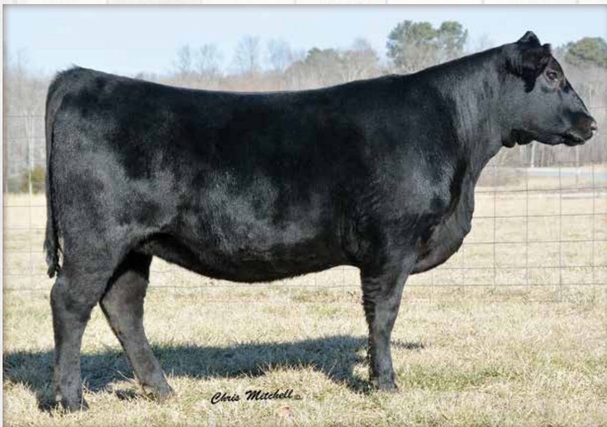
BoBo Evergreen Erica 2529 / Lot 8

Selling half interest with the option to double the purchase price and own full interest in Evergreen Erica 2529 the powerful growth and MB female combining Total Impact 745 with the former prolific BoBo Angus donor, Evergreen Erica 7023.