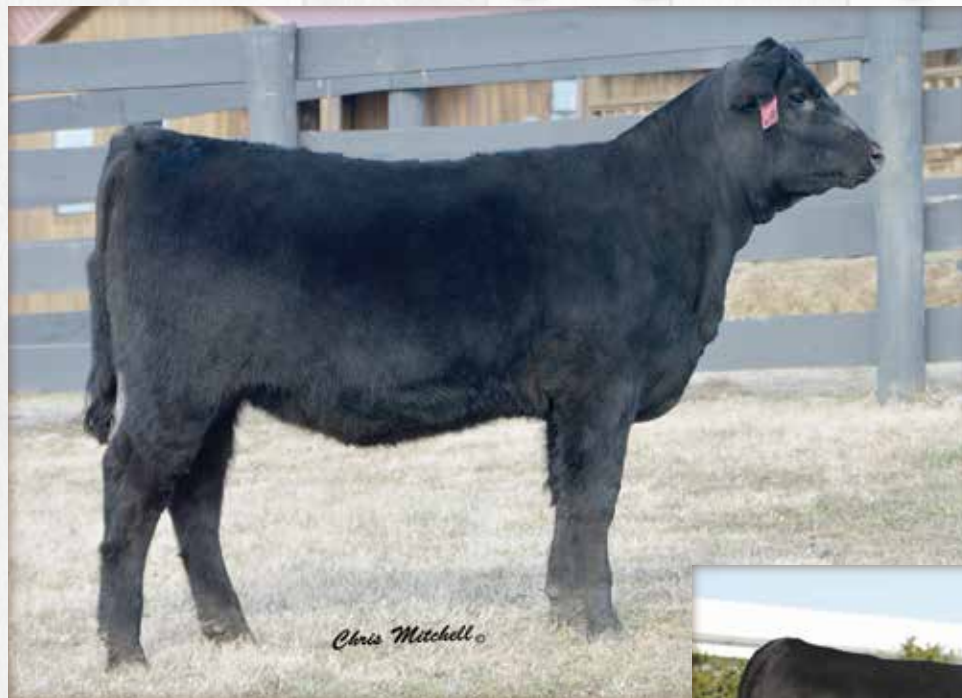
Crazy K Lady Jaye 5153 / Lot 17A

Werner War Party 2417 / Maternal sisters to this feature of the 44 Farms, Werner Angus, KiamichiLink Ranch and Select Sires herd sire batteries sell as Lots 17A through 17D.