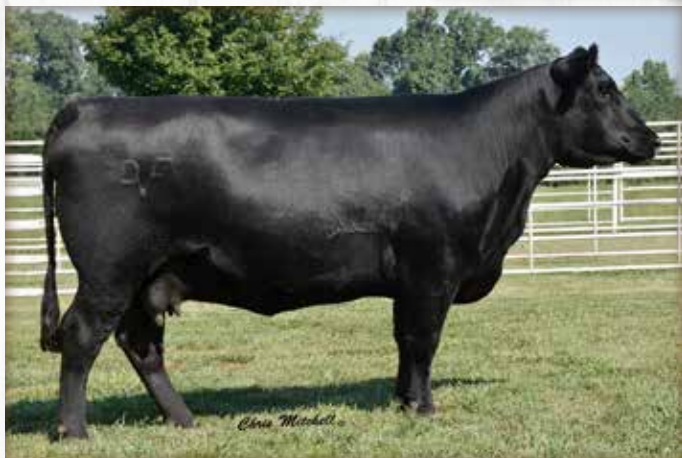
Deer Valley Blackcap 9822 / A daughter sells as Lot 21.