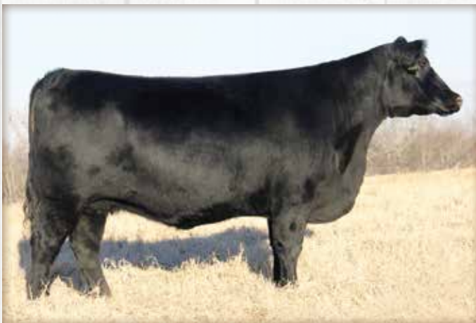
Rita 0M5 of Rita 5F56 Pred / A daughter of this cornerstone Blackcap in the Quaker Hill Farm and Hutson Farms joint embryo programs sells as Lot 50.