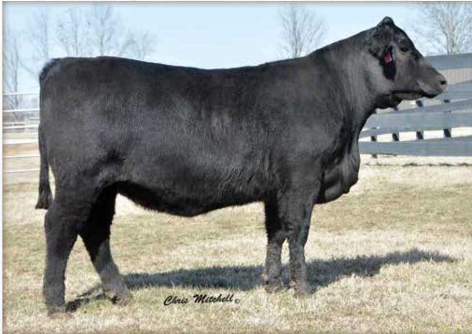
Crazy K Rita 4286 / Lot 4

Rita 4286 is a sensational growth and carcass prospect sired by the record-selling Denver and produced by the $74,000 valued Blackstone Cattle Company and KiamichiLink Ranch donor, New Design 0545.