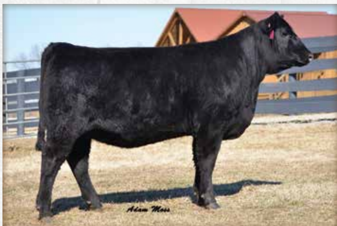
Deer Valley Blackcap 3172 / A daughter sells as Lot 22.

• Blackcap 5017 is the powerful low birth, growth, MB and $B female combining the $300,000 valued calving-ease and growth sire, All In with a direct daughter of the $220,000 valued Deer Valley Farm and Vintage Angus Ranch donor, New Design 4212 by All Around. • The dam of Lot 21 balances a BR 3@93 with a YR 1@100. Maternal siblings to the dam of this powerhouse heifer include: Blackcap 0390, the $100,000 valued half interest selection of XL Angus as the second high-selling open cow of the 2013 Vintage Angus Ranch Sale; Blackcap 3124, the $40,000 selection of Wheeler Ranches in the 2013 Deer Valley Farm Sale; Blackcap 0904, the $15,500 selection of Bricton Farms through the 2012 Deer Valley Sale; Blackcap 1182, the $15,000 selection of Pollard Farms in the 2011 Deer Valley Sale; and VAR Upfront 0392, the featured member of the herd sire batteries of Vintage Angus Ranch, Deer Valley Farm, KiamichiLink Ranch and Accelerated Genetics. • Blackcap 3172 a maternal sister to Lot 21 was the $240,000 valued and top-selling female of the first Crazy K Ranch sale selected by BoBo Angus and her daughter sells as Lot 22.