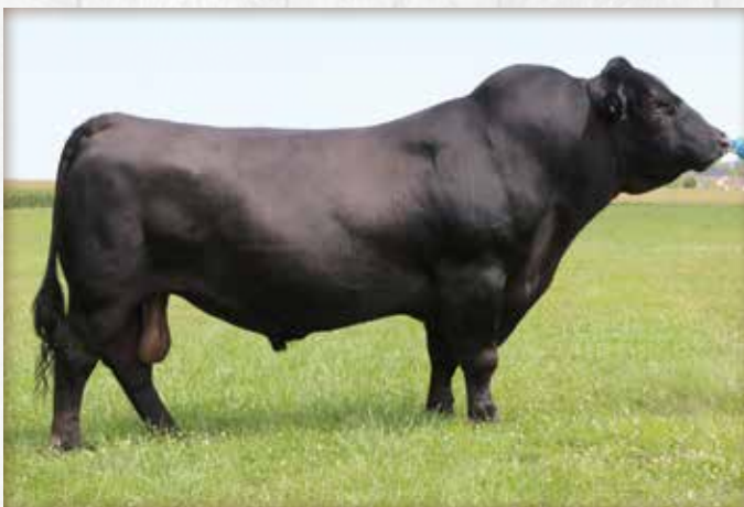
Quaker Hill Rampage 0A36 / A daughter of this multi-trait breed leader sells as Lot 74A.

73A Crazy K Carol Ann 5164 Birth Date: 8-30-2015 Cow 18267940 Tattoo: 5164