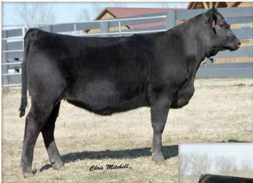
Crazy K Rita 5107 / Lot 18D