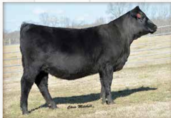
Crazy K Rita 5058 / Lot 5C