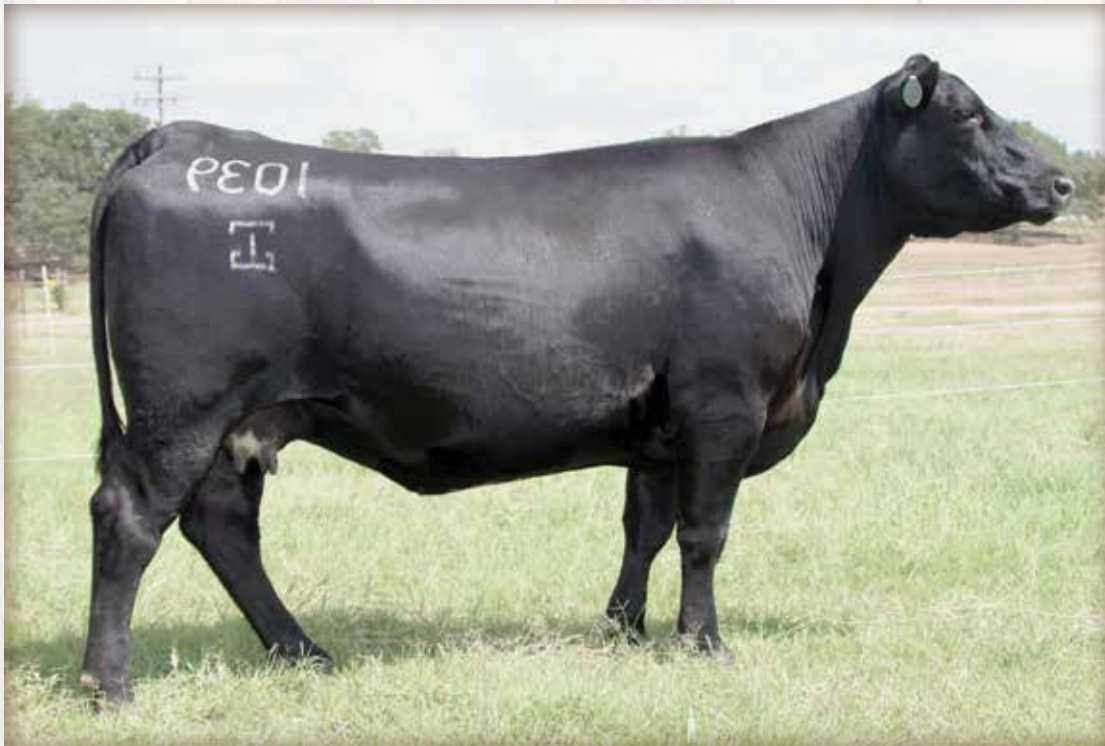
GAR 5050 New Design 1039 / The $29,500 donor dam of Lot 3 selected in the 2014 HillHouse Angus Sale by Percy Angus Ranch.