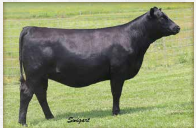
Blackstone Rita 4466 / A maternal sister to this selection of Pollard Farms through the 2015 Blackstone Cattle Company Sale sells as Lot 4.