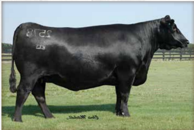
GAR Predestined 2578 / A daughter of this foundation Edisto Pines Farm Rita sells as Lot 47.