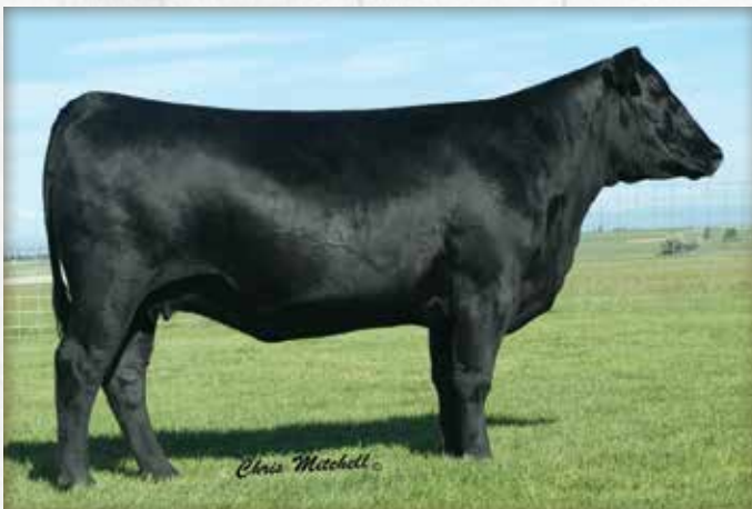
Riverbend Blackbird 4131 / A daughter sells as Lot 23.

• Blackbird 1757 posts ultrasound ratios IMF 1@107 and REA 1@106. The dam of Lot 23 records a WR 5@100 and a YR 3@101 while showing an ultrasound IMF ratio 33@107 with 16 daughters maintaining a combined WR 37@102. • Has a 1/12/16 bull calf, Lot 23A, by VAR Discovery 2240, tattoo 6021. • Has a 10/26/05 heifer calf, Lot 23B, by AAR Ten X 7008 SA.