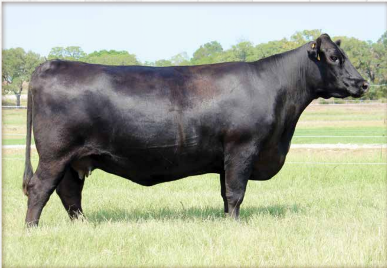
SMR Rita 9502 / Lot 18