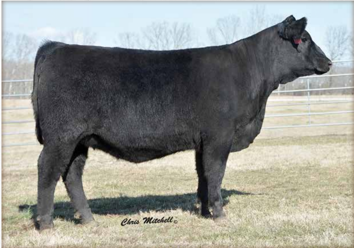
Crazy K Rita 5030 / Lot 25