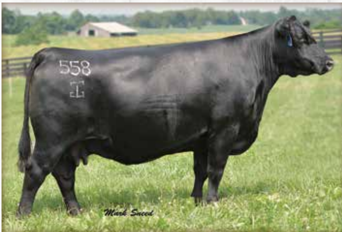
GAR Bextor 558 / A daughter of this full sister to the growth and MB leader Prophet sells as Lot 7.