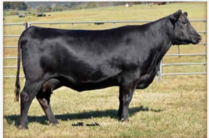
EF Queen 8210 / A daughter of this full sister to the MB leader Predestined sells as Lot 54.