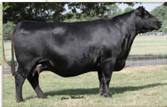
PF 11 Primrose 6572 / A daughter of this powerful foundation Jac's Ranch Primrose sells as Lot 66.