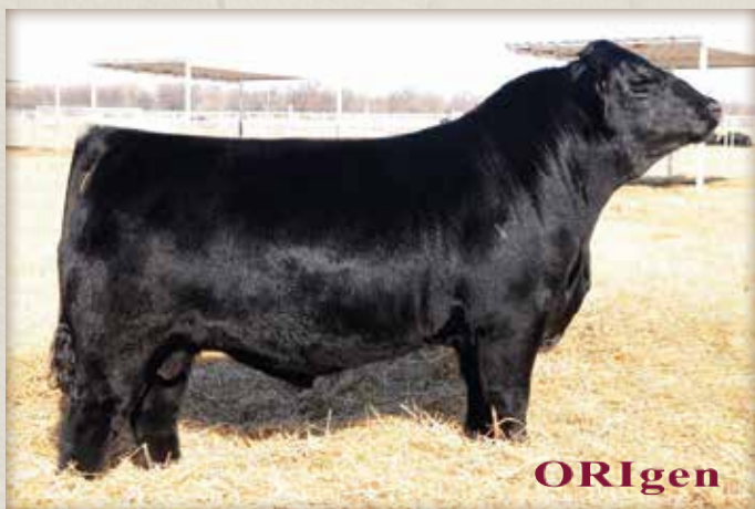
EXAR Stetson 3704B / Reference Sire C

Owned with Express Ranches, Yukon, OK and The Stetson Group