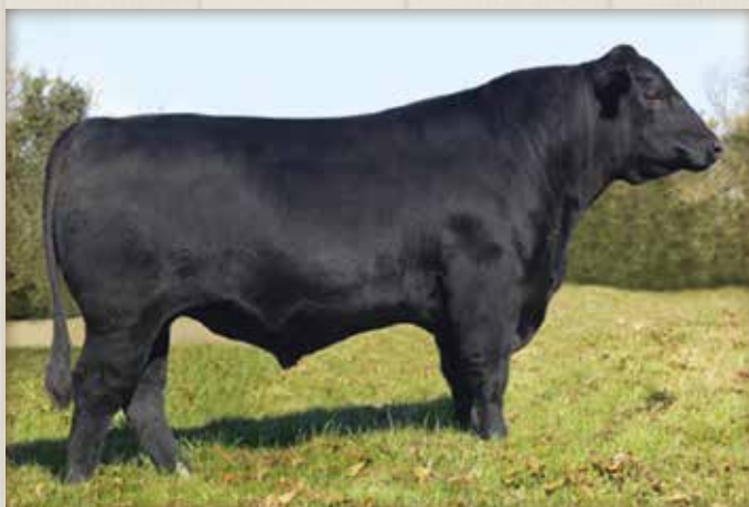
44 CKR King James X005 / Reference Sire D