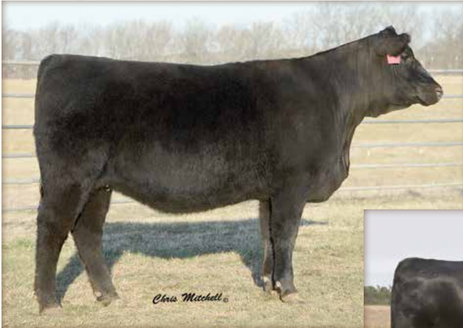
Crazy K Objective 5025 / Lot 29