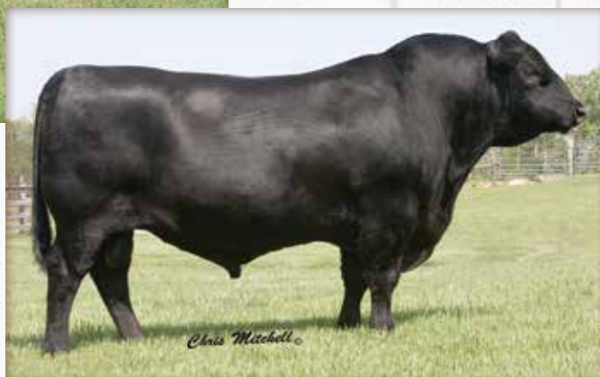
B/R 65R Genesis / A maternal sister to the proven MB and $B sire sells as Lot 24.