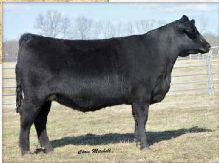
Crazy K Henrietta 5013 / Lot 13A