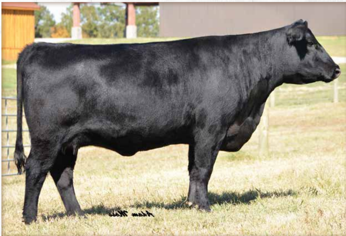
44 Blackcap Empress W733 / Lot 24