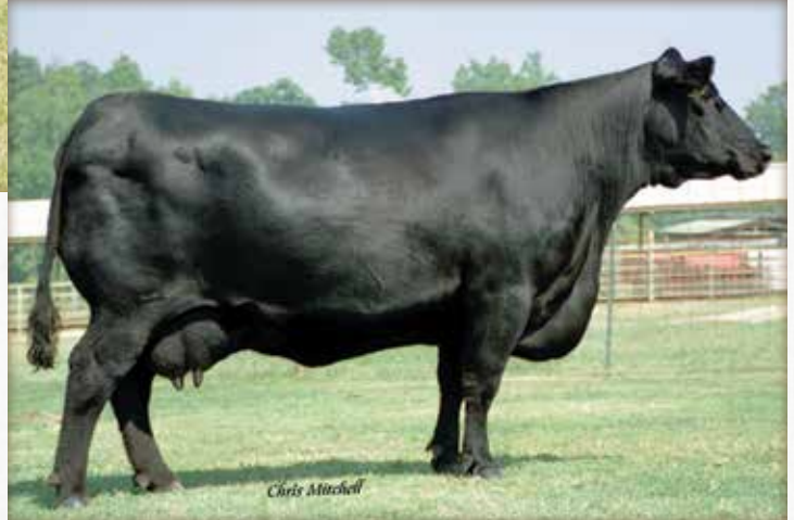
SVF Forever Lady 57D / A granddaughter of this power female sells as Lot 80.