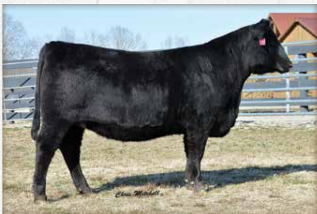
Crazy K Lady Jaye 3424 / The $14,000 selection of Cannon Ridge Ranch in the 2015 Crazy K Sale.