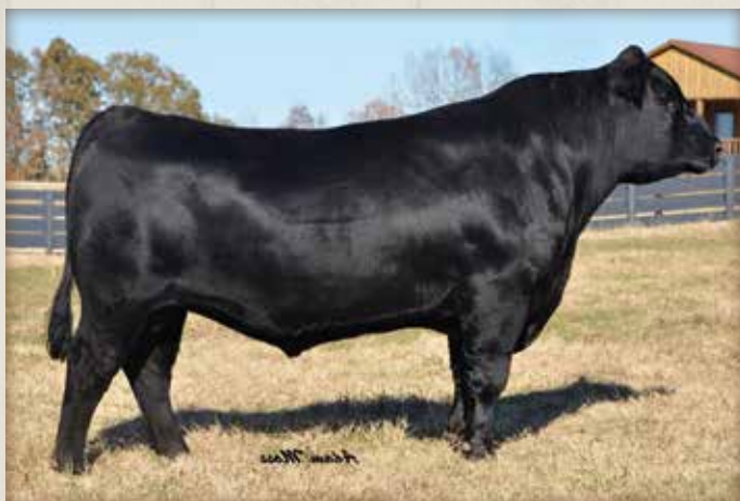
VAR Confirmed CKR 1269 / Reference Sire A