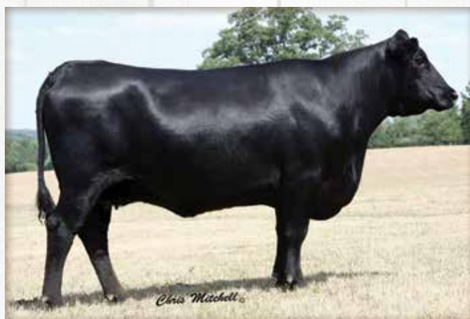
B/R Blackcap Empress 8183 / The Pathfinder Grandam of Lot 24.