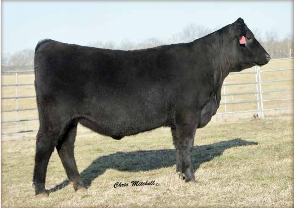
Crazy K Blackcap 5001 / Lot 28