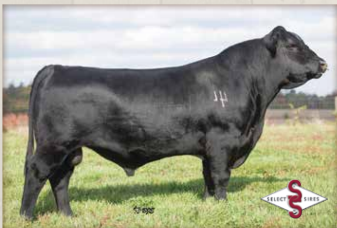
44 Conveyance 0X52 / Reference Sire E

Owned with 44 Farms, Cameron, TX and Conveyance Breeders, Seaman, OH