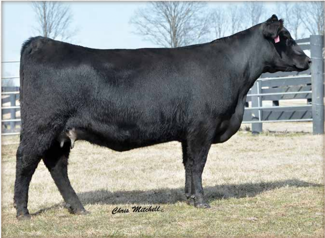
Vintage Blackcap 4021 / Lot 19