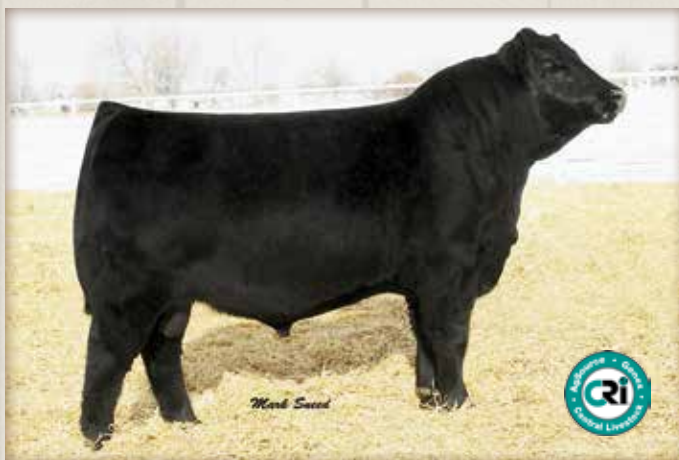
EXAR Significant 1769B / Reference Sire F

Owned with Express Ranches, Yukon, OK and The Significant Group