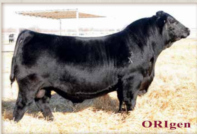
EXAR Resistol 3710B / Reference Sire B

Owned with Express Ranches, Yukon, OK and The Resistol Group