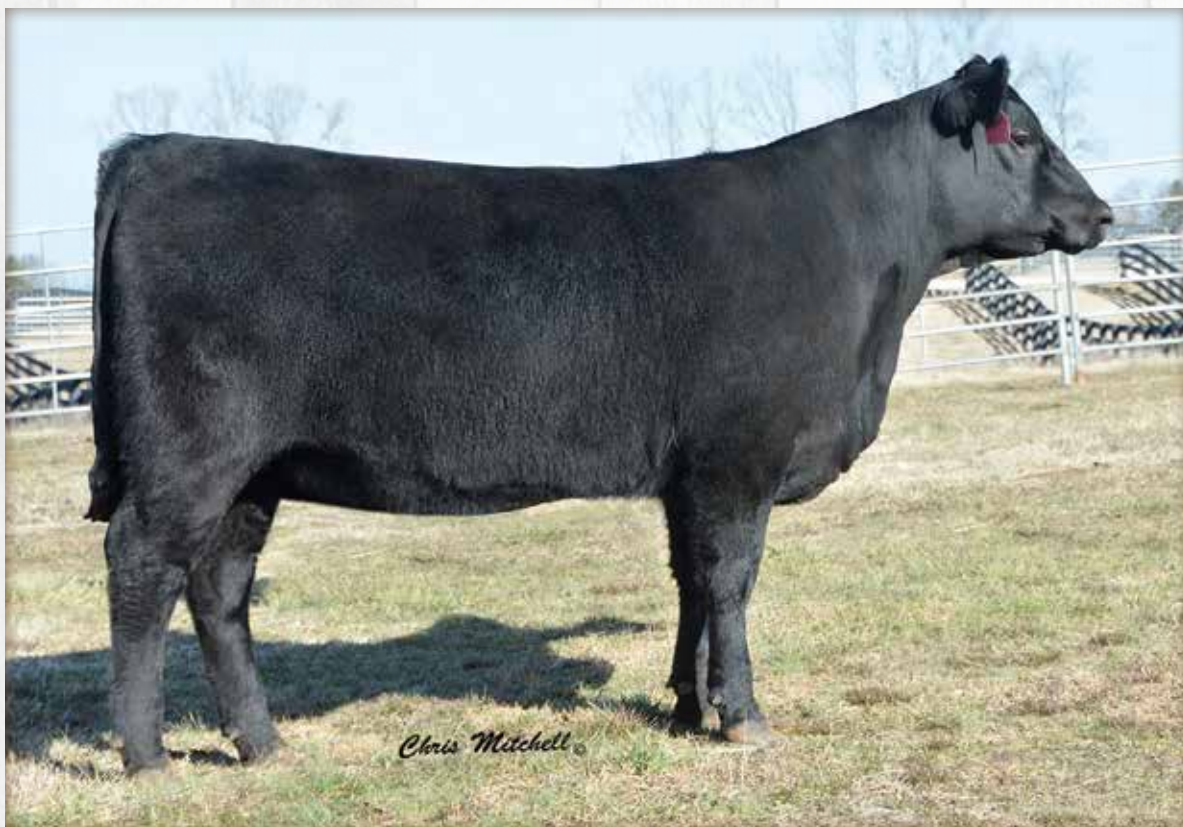
Crazy K Fanny 5023 / Lot 2A