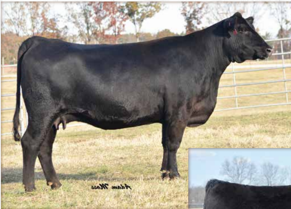
Deer Valley Henrietta 1822 / Lot 13