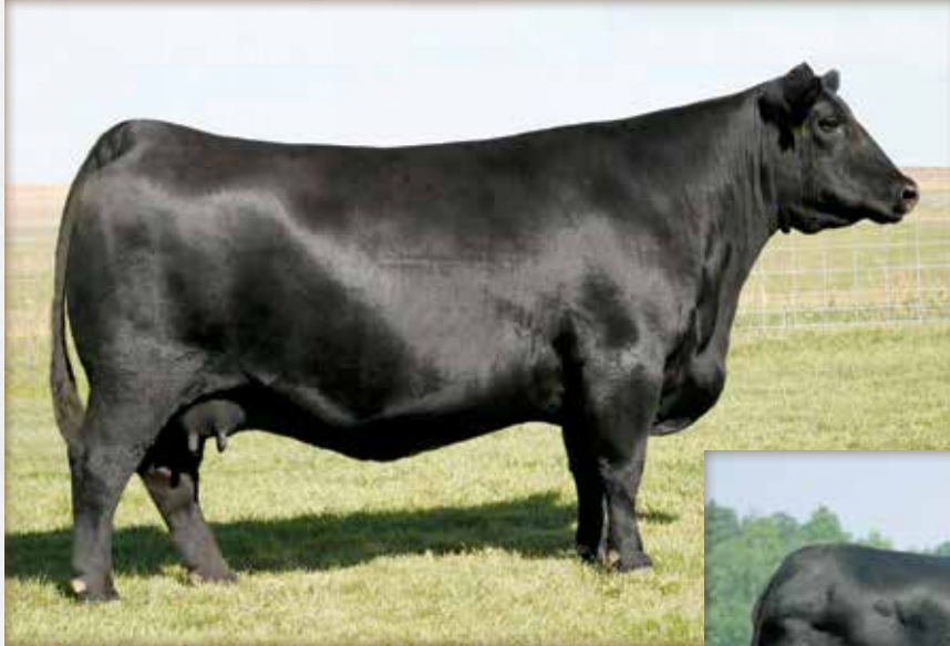
Rita 2811 of 2536 BVND 878 / The $330,000valued grandam of Lot 79.