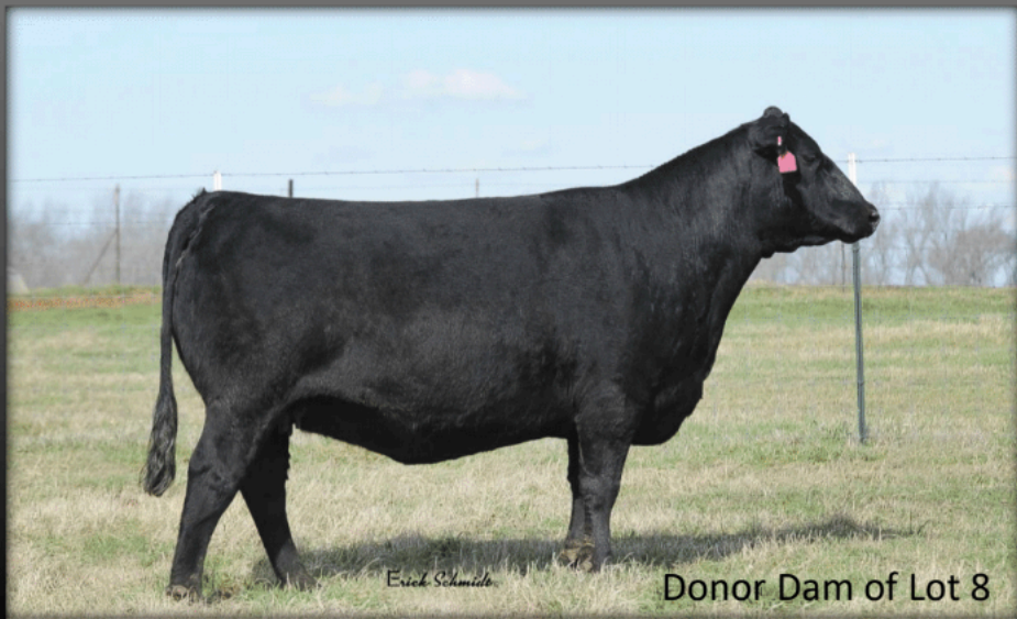
Donor Dam of Lot 8