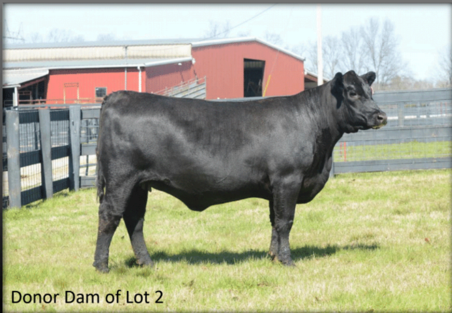
Donor Dam of Lot 2